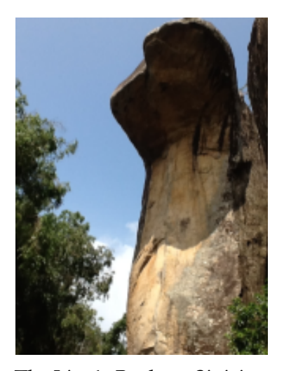
The Lion's Rock at Sigiriya

Each participant must provide the following details: Name, gender, date of birth, passport number, date of issue of passport, date of expiry of passport, place of issue of passport, and emergency contact information.