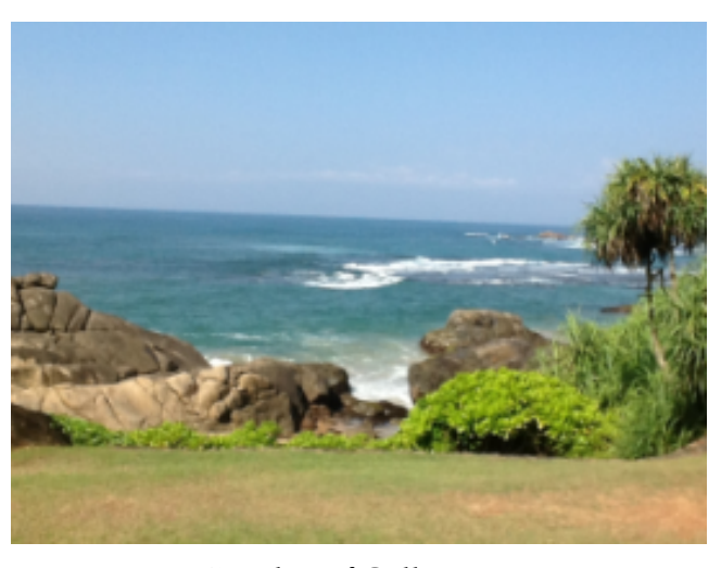
Beaches of Galle