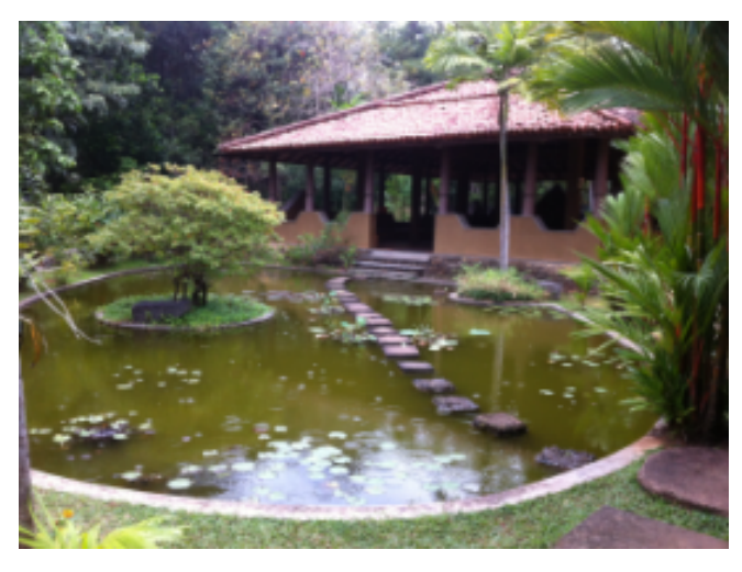
Sarvodaya Center at Moratuwa